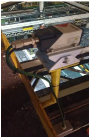
Fig 1: Dimetix laser distance sensor installed on a crane system

In overhead crane automation, Laser Distance Sensors from Dimetix provide highly precise, real-time measurements for both automatic positioning and defining blocked areas. Automatic positioning involves the operator selecting a target location via radio control, after which the crane moves to the precise X and Y coordinates using data provided by PROFINET-connected lasers. These sensors offer sub-millimeter accuracy, ensuring exact crane movements, even over long distances. Their long-range capabilities up to 500 meters allow for highly efficient positioning in large industrial environments.