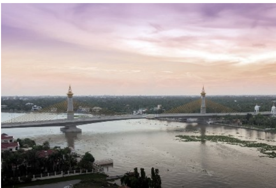
Fig 1: Chao Phraya River Bridge

Aplica Advanced Solutions GmbH, based in Vienna, specializes in monitoring and supports its customers worldwide in securing bridges, from construction monitoring to ongoing maintenance. For several years, Aplica has successfully utilized Dimetix Laser Distance Sensors in its projects.