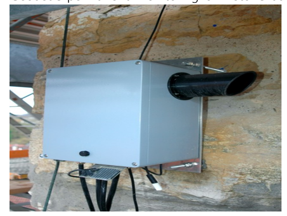
Fig 1: Dimetix Laser Sensor installed at the historical building "Blauer Turm" in Germany

Geodetic permanent monitoring of historic buildings is designed to support redevelopment concepts. Historical